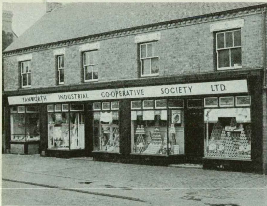
No. 1 BRANCH, NEW STREET, DORDON